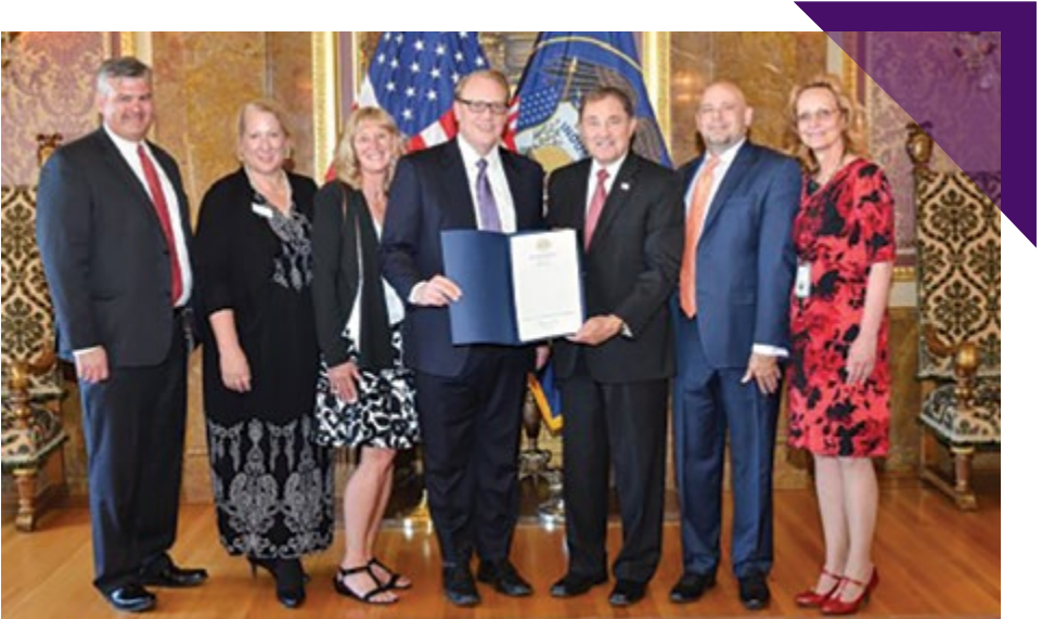
Advocating for Alzheimer's